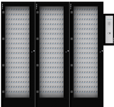
L-Series system with 2 extension cabinets

Extension cabinets can be connected to the L-Series system allowing up to a maximum of 540 keys to be managed from a single control pod.