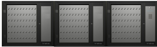
Fig 2. S-Series system with 2 extension cabinets example

Extension cabinets can be connected to the S-Series system allowing up to a maximum of 540 keys to be managed from a single control pod.